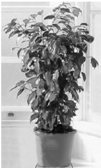
Ficus plant brings to voters a new choice.

T he campaign is called Ficus 2000. That's ficus, as in the popular house and garden plant. Michael Moore, creator of the campaign, is encouraging America to enter and vote for their favorite ficus plant for political office. He says, "In a country where the majority no longer vote, writing in Ficus will give the disenfranchised voter a chance to cast a vote for "None of the Above."